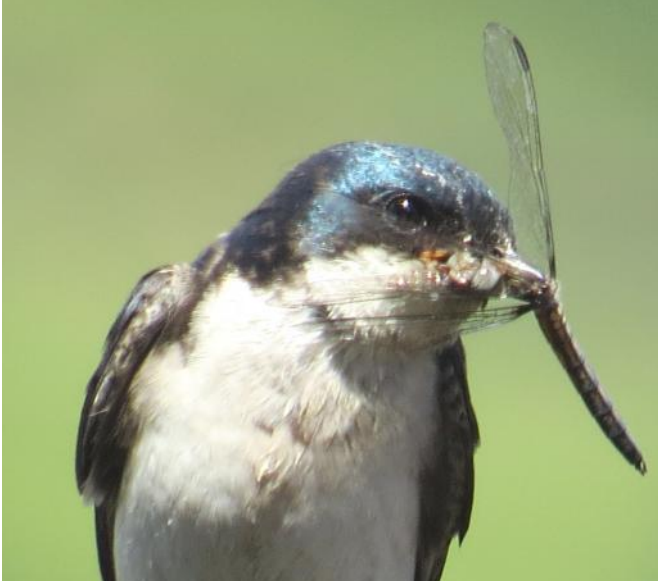
Tree Swallows are investigating nest boxes and getting ready to move in!