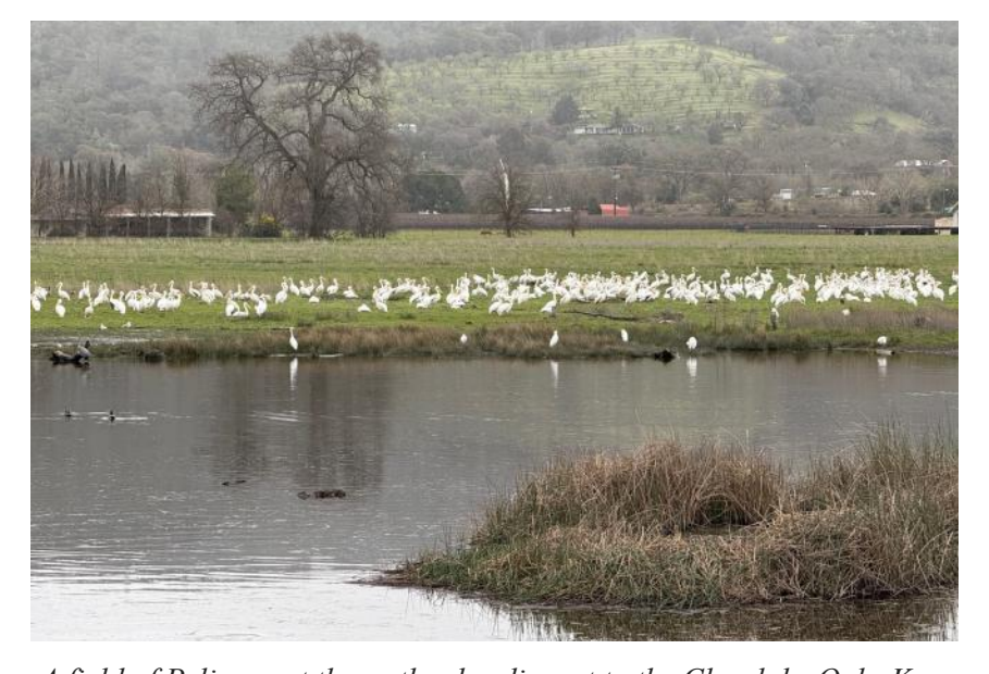
\label{lem:adjacent} \textit{A field of Pelicans at the wetlands adjacent to the Clearlake Oaks Keys.}