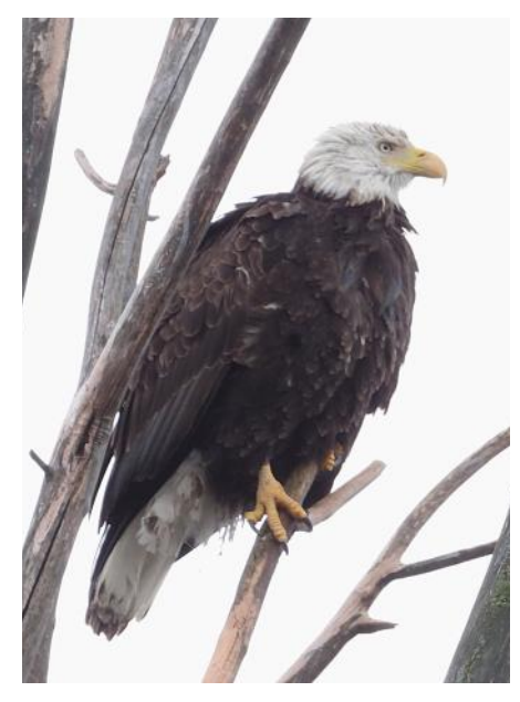
A Bald Eagle in the rain at the Clearlake Keys wetland channel.