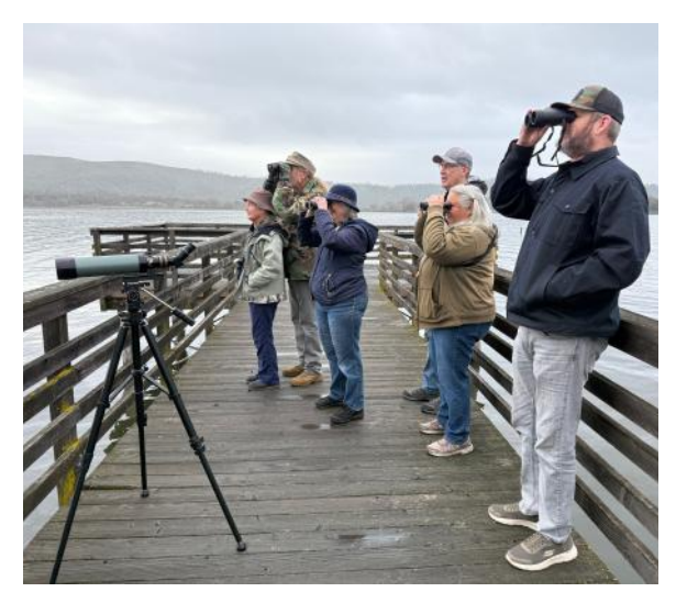
The Redbud Audubon group enjoying birding from the pier near the boat launch area at Clarks Island in Clearlake Oaks at the March 22 field trip.