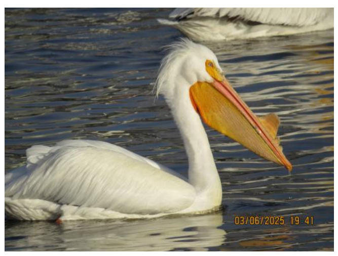
Pelican with breeding bumps at Keys wetland.

This is always a fun and productive field trip. We urge folks to join us. It's a lot of fun!