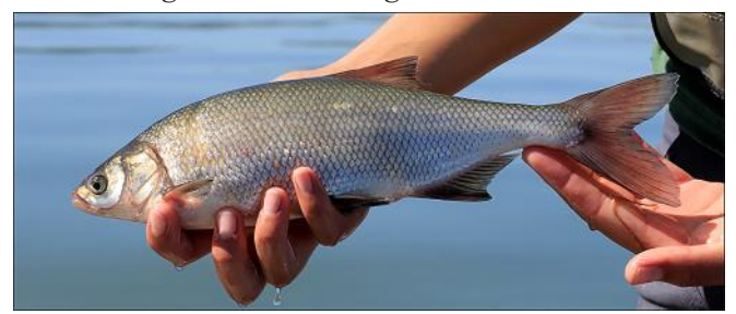
Clear Lake Hitch.