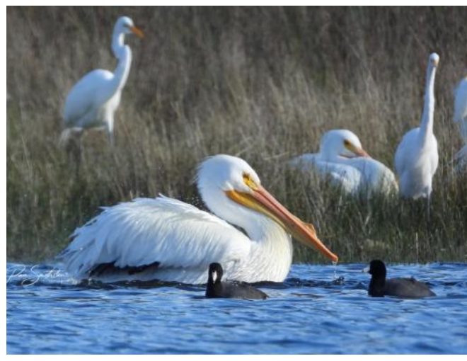
The White Pelicans are still abundant here but should be returning to their breeding areas soon.