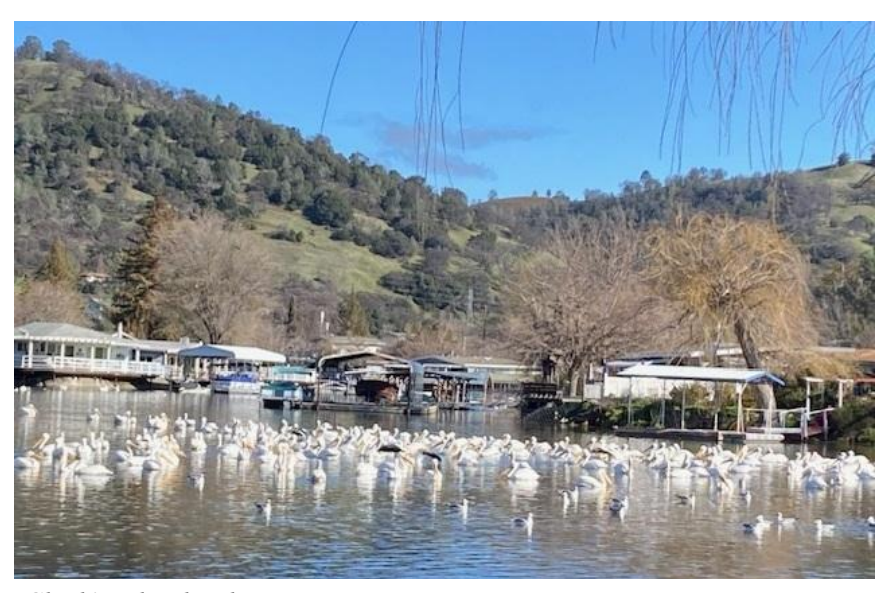
Clark's Island Pelicans.